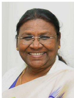
Droupadi Murmu (a president of India)

Droupadi Murmu is the new President of India. She defeated the opposition candidate Yashwant Sinha in the election, the result of which was announced on Thursday (July 21). Murmu, 64, is the first Adivasi and second woman to become the nation’s First Citizen and the Supreme Commander of India’s Armed Forces.